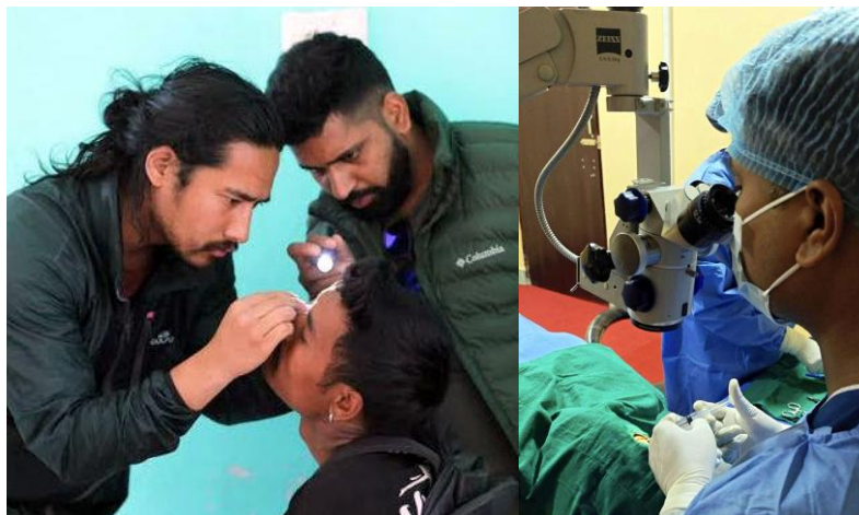
Image 5: This shows team members performing screening eye examinations and subsequent surgery being performed to remove a cataract and insert as prosthetic lens which restores the patient's sight.

In addition to helping by identifying those with refractive errors whose quality of life can be improved with prescription glasses the team can provide, 'Trek and Treat' is an integral part of the success story in Nepal in national efforts to identify and treat blindness due to cataracts. Cataracts are the leading cause of preventable blindness worldwide (Luitel et al, 2024). Experts travelling with the 'Trek and Treat' team deliver cataract surgery 'camps'. The required surgical equipment is carried by porters and then set up in temporary operating facilities so that those requiring surgery can be operated on, in spite of where they live being remote from a regular health care facility. The 'Trek and Treat' team is taking the provision of eye care to new heights in Nepal.