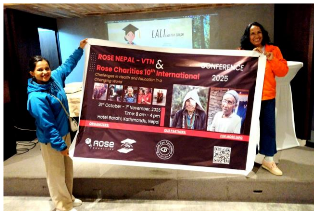
Image 2: The conference poster highlighted the hosts of the meeting Rose Nepal and Vision Together Nepal (VTN) and acknowledged the meeting as the 10 th International conference hosted by Rose Charities.