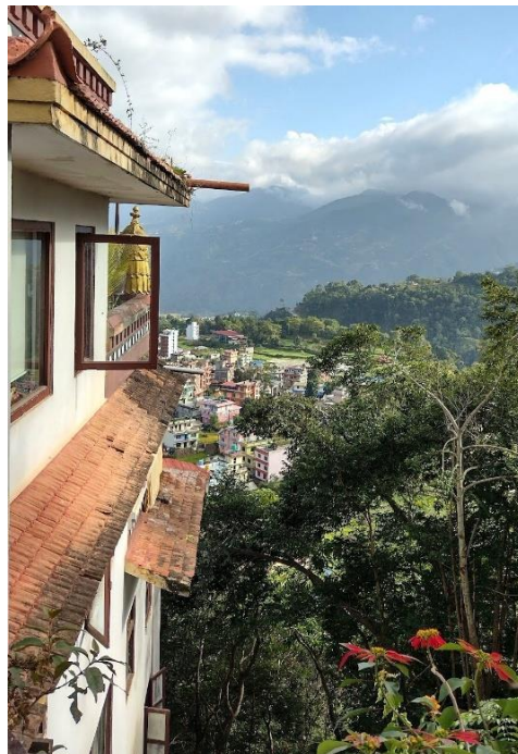
Image 12: In Kopu the Rose charities director has been proactive in leading efforts to raise funds, obtain materials and coordinate construction of multiple housing units for the benefit of the community.

As in many countries, making affordable housing available for those who need it is a recurring challenge. This is another area where inspiring initiatives are happening in Nepal