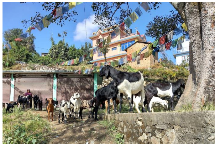
Image 10: Animal husbandry is an important feature of life in rural Nepal, and sustainable practices related to livestock taught at the school include the breeding and care of goats, cows and chickens.

The sustainable farming school incorporates multiple facets of crop cultivation, animal husbandry, growth of produce and other farm-related practices. Donors from Rose charities have provided equipment to enable a range of skills to be taught such as bee keeping, rotor tilling and the milling of grain.