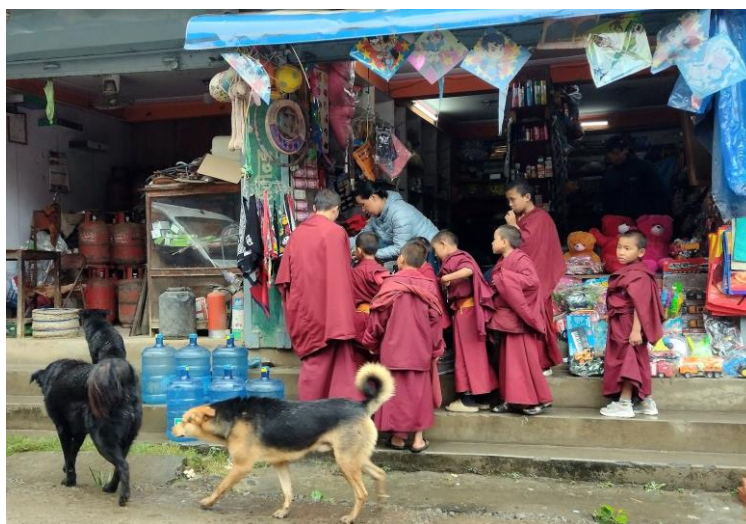
Image 7: While the many monasteries in Nepal provide religious instruction with schooling in parallel for the novice monks in their care, nuns are also among those who benefit from the 'Open school' program, as it is a way for them to complete their formal education.

Open schools particularly benefit women married as teenagers. In Nepal child marriage affects approximately 37% of girls prior to the age of 18 and 8% by the age of 15 (Seta, 2023). As in other parts of the world child marriage has significant effects on young women's health and wellbeing because of early pregnancies and the consequences of dropping out of school.