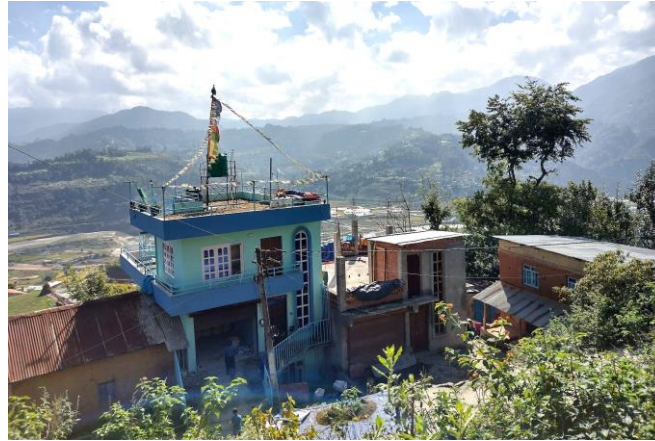
Image 8: Among the valuable traditions of Rose Charities international conferences, making site visits to see working project delivery first hand is one of the most worthwhile. Kopu is a village situated in a rural valley 18 kilometers from Kathmandu and projects there include an ‘Open’ school, a sustainable farming initiative and a social housing building program.