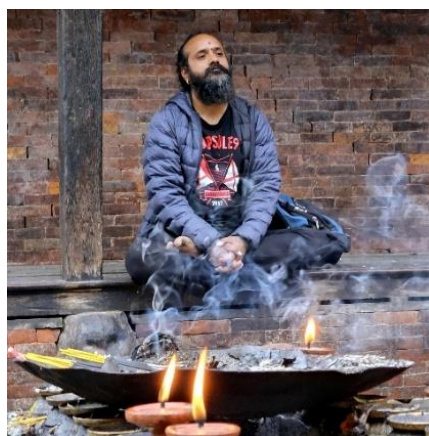
Image 3: Nepal has deep religious and spiritual traditions. The country is famous for being a peaceful home to people of different beliefs where respect for one another's religion is a common value (Mahat, 2024).

Participants learned how Nepal is taking global health to new heights in a series of presentations. These followed reviews of how families can prepare for the health effects of global warming (Macnab, 2025) and the imperative for action in response to climate change (Romanello et al., 2023), and the contribution of Rose charities project activities around the world. The innovations described in the presentations reflect the deep cultural and spiritual nature of life in Nepal, and also challenges presented by social determinants of health that impact Nepal’s population.