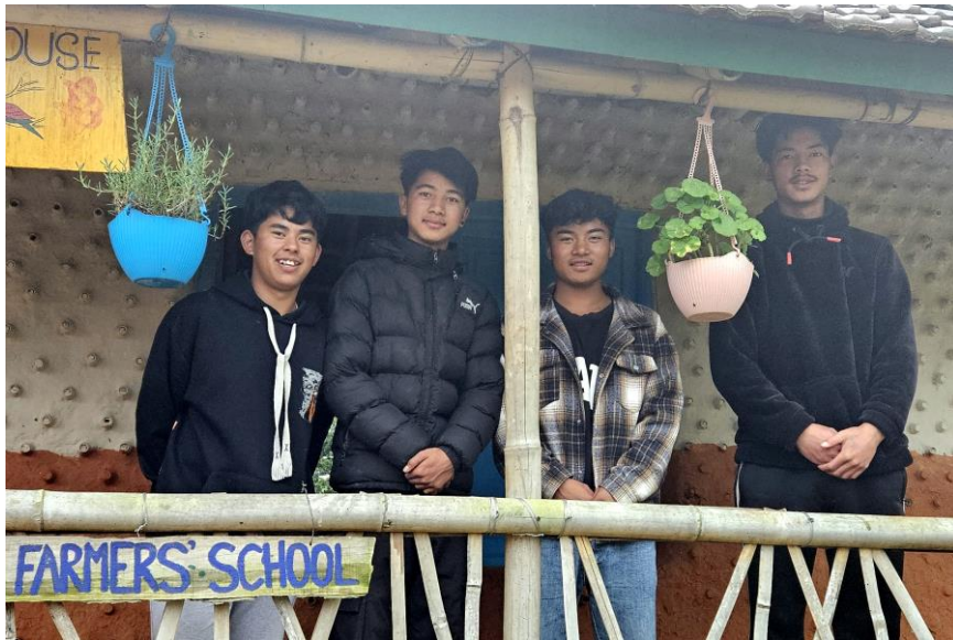
Image 11: The sustainable farming school is a model for the community and teaches techniques relevant to improving yield and diversity in agriculture. The school also allows young people who have not flourished in conventional education to learn in a formative and supportive environment. This has social and emotional benefits through skills being learned in parallel with the building of self-esteem.

As in many countries, making affordable housing available for those who need it is a recurring challenge. This is another area where inspiring initiatives are happening in Nepal