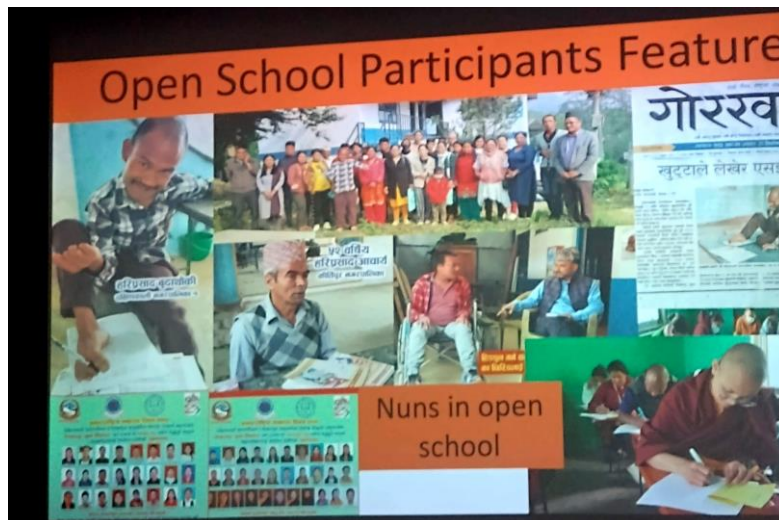
Image 6: A speaker's composite image from the conference illustrating the broad range of students who can now benefit from 'Open School' opportunities in Nepal

Rose charities Nepal is an integral part of several innovative community-based projects ( https://www.rosecharities.ca › rose-charities-nepal ). One important socially perceptive innovation in Nepal is the introduction of 'Open Schools'. These allow individuals who have missed the opportunity to follow conventional schooling through to graduation to return to studying. Courses allow each individual to progress in a 'self-paced' manner supported by staff who appreciate the challenges and benefit this kind of opportunity offer.