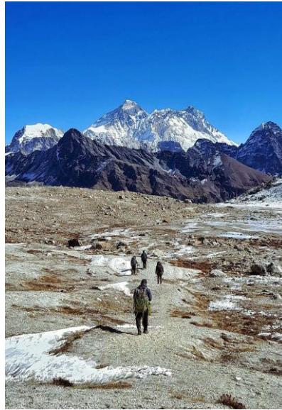
Image 4: Planned in collaboration with the mayors and ward chairmen of each community the 'Trek and Treat' team treks on foot into remote regions of Nepal to conduct assessments of the needs of people living far from accessible health care facilities, and then returns with volunteers able to treat the conditions identified.

The social determinants of health are the conditions in which people are born, grow, work, live and age, and the wider forces that shape the conditions of daily life (World Health Organization, 2025). Geographic location and the ability to access care are two fundamental social determinants of health and both have particular impact on populations living in mountain communities in Nepal. An innovative program that addresses these inequities in the context of eye care is 'Trek and Treat' ( https://visiontogethernepal.org.np ); teams able to provide screening for eye conditions travel into remote mountain areas and provide services normally unavailable in these communities.