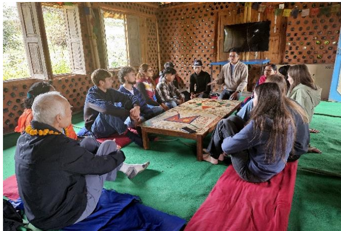
Image 9: Delegates from the conference meeting with the principal of the ‘Open school’ in a house constructed using bottles recycled as building material. The base of the bottles can be seen within the walls, and the novel space provides a gathering place for participants in the school and the farm programs.

The sustainable farming school incorporates multiple facets of crop cultivation, animal husbandry, growth of produce and other farm-related practices. Donors from Rose charities have provided equipment to enable a range of skills to be taught such as bee keeping, rotor tilling and the milling of grain.